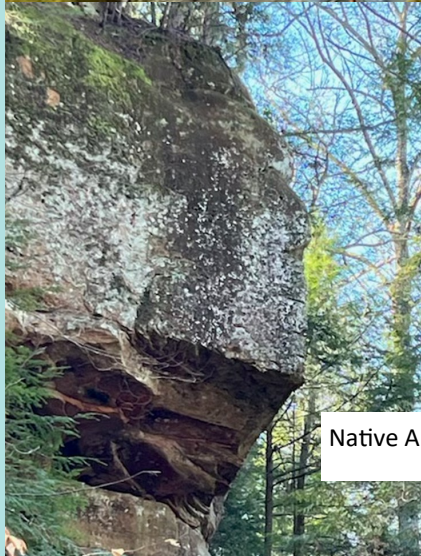
Native American Head